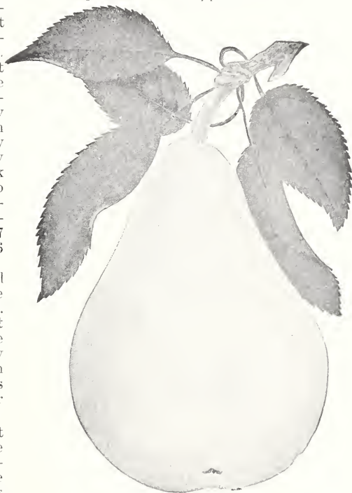
The Beierschmitt Pear

MARQUETTE PEACH. A variety from northern Michigan. Claimed to be very hardy. Grafted on plum roots which should increase the hardi-